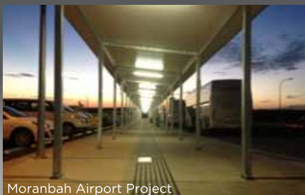
Moranbah Airport Project

“We are devoted to build, nourish and maintain a happy and satisfied client base through superior quality and creating long term business relationships with customers, suppliers and employees.”