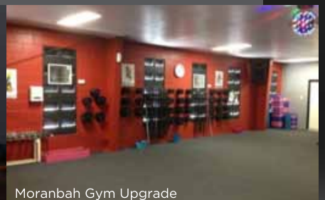
Moranbah Gym Upgrade

Our works range from community projects, to domestic works, commercial jobs through to industrial mine site projects.